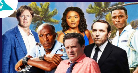
Death In Paradise