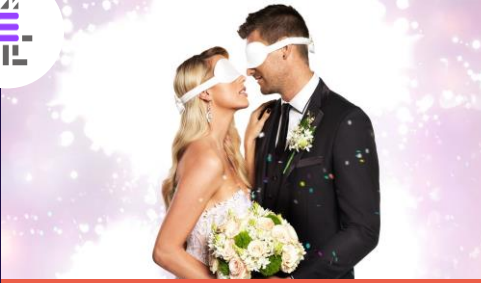
Married at First Sight Australia