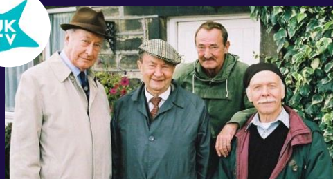
Last of the Summer Wine