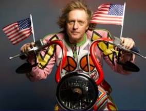
Grayson Perry's Big American Road Trips - Wednesday 10pm

Launched with 574k viewers. A 6% ABC1 Share is up 42% on the slot average