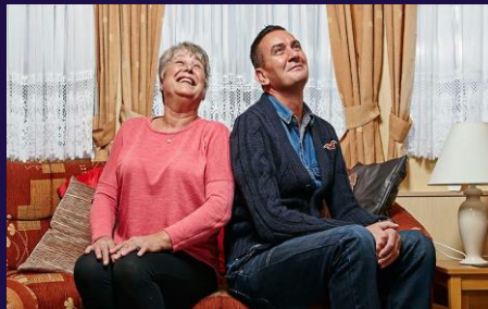
Gogglebox- Friday 9pm

Across the lockdown period year-on-year viewing among 1634 Adults to C4 News is up 62%