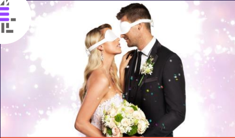
Married at First Sight Australia