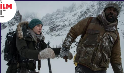
The Mountain Between Us