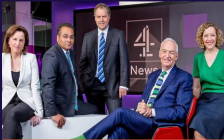
Channel 4 News Weekdays 7pm

Across the lockdown period year-on-year viewing among 1634 Adults to C4 News is up 62%