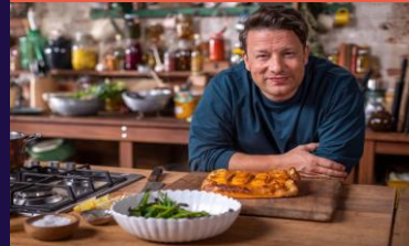
Jamie: Keep Cooking - Monday 8:30pm

Up 20% week-on-week with 1.1m viewers and Up 13% on the slot average for 1634 Viewers