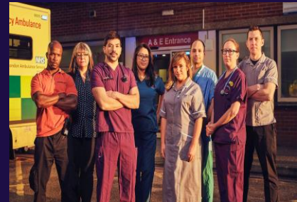
24 hours in A&E - Wednesday 9pm

Week 3 of Gogglebox attracted an overnight audience of 4million. Up 1% on last week. A 29.4% ABC1 Share was a new high while a 50.53% 1634 Share is the biggest for the regular series and 2nd only to the Celeb episode earlier this year.