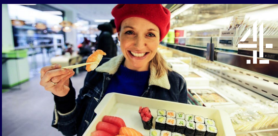
Food Unwrapped: Fast Food Special - Tuesday 8pm