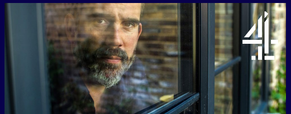
How to Avoid a Second Wave - Tues 9pm

- On Tuesday, the Food Unwrapped Special attracted an overnight of audience of 1.17 million with an 8% share of 1634s