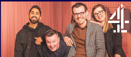
Inside Missguided - Weds 10 pm

- The episode reached an 11% share of ABC1s, an increase of 46%