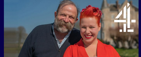
Escape to the Chateau: Make Do and Mend - Thurs 8pm