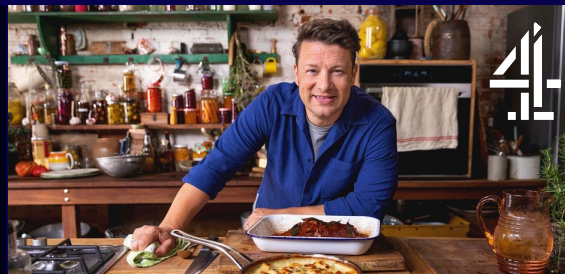
Jamie: Keep Cooking Family Favourites - Monday 8:30pm

- It pulled in a share of 8%, reaching an increase of 24% versus the slot average