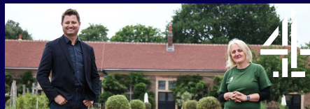
George Clarke's National Trust Unlocked - Sunday 9pm

- Episode 2 of the look into the huge fast fashion brand delivered a 10% share of 1634s. This was up 24% against the slot average, enough to beat Itv as the biggest commercial channel