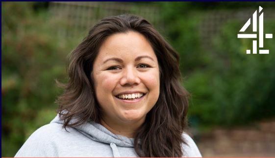
Lose a Stone in 21 Days with Michael Mosley - Wednesday 9 pm