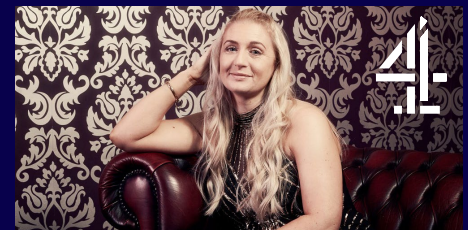
Swingers - Monday 10pm

- A 12% share of ABC1s meant that the episode was up 65% versus the slot average, beating Itv