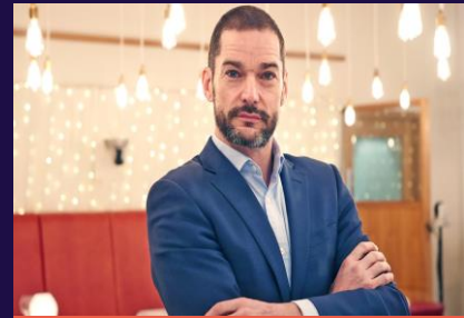
First Dates – Thursday 9pm

Week 6 of Gogglebox attracted an overnight audience of 4.419 million. Up 2% on last week's episode and the 5th consecutive week of growth. It won the 9pm slot once again by a huge margin for Share and Volume against all key demo's. A 29.95% Share of 1634's was enough to win late peak on Friday across all Channels and our 2nd Biggest Friday LP Share of the Year!