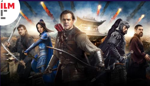
The Great Wall