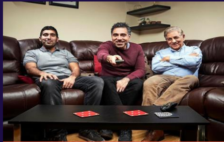
Gogglebox- Friday 9pm

Taskmaster launched with 1.687 million and a 10.1% Share. Up 44% and 50% respectively on the slot averages.