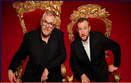
Taskmaster – Thursday 9pm

Taskmaster launched with 1.687 million and a 10.1% Share. Up 44% and 50% respectively on the slot averages.