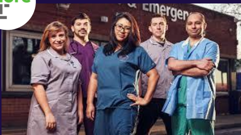
24 Hours in A&E