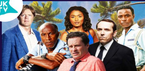
Death in Paradise